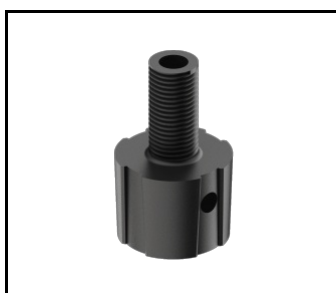
SKVER R male adapter thread M20x40 (pitch 2.5) (804427)