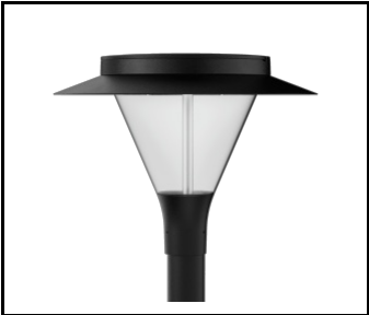
SKVER Hood example 1 RAL9005 (435522)