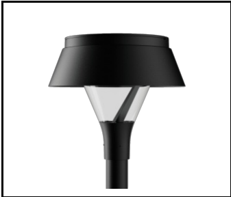
SKVER Hood ULR example 2 RAL9005 (421518)