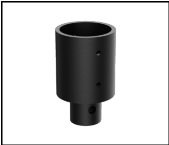
SKVER external adapter fi60 (804588)