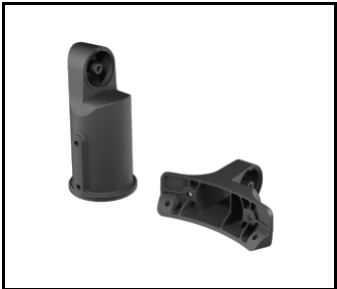
SKVER R Adjustable handle Dark Sky black (804618)