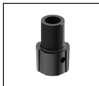
SKVER R male adapter thread 1 inch x40 (gas) (804434)