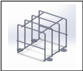
Protection grid Sensor Hytronik HIM84 RAL 9003 (80001265)