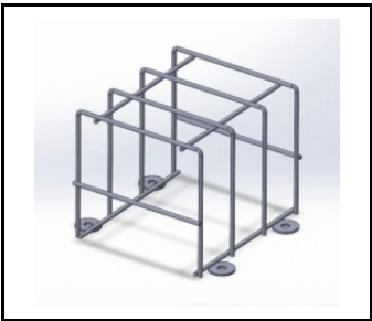
Protection grid Sensor Hytronik HIM84 RAL 9003 (80001265)