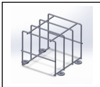
Protection grid Sensor Hytronik HIM84 RAL 9003 (598913)