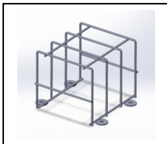
Protection grid Sensor Hytronik HIM84 RAL 9003 (598913)