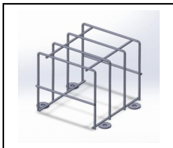
Protection grid Sensor Hytronik HIM84 RAL 9003 (598913)