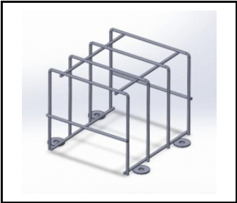
Protection grid Sensor Hytronik HIM84 RAL 9003 (80001265)