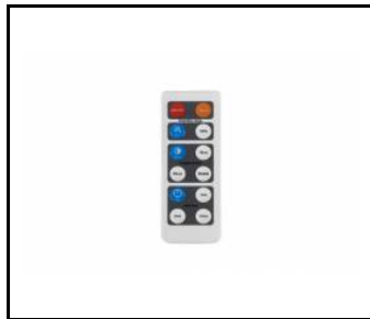
Remote control for motion sensor HD01R (WSEL438)