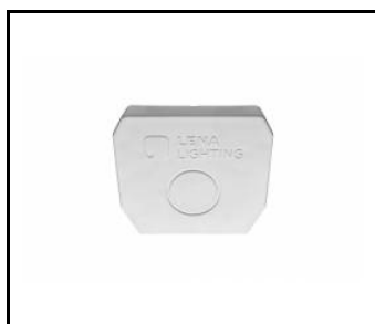
LINEA S LED – end cap IP40 push-in (980060)