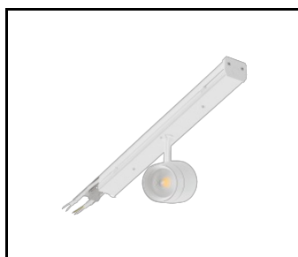
LINEA S LED ECO 588mm - 1xEXPO ADJUST 2050lm DALI zoom 22-55st. White 840 20W (594465)