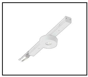
LINEA S LED ECO 588mm 260lm AW DOT CS 2W 1h NM AT (594458)