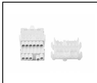
Linea S LED power set 7P (980978)