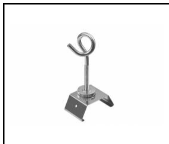
LINEA S LED chain pendant (981425)