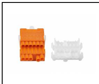
LINEA S LED power set 11P (981388)