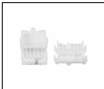
LINEA S LED power set 5P (980084)