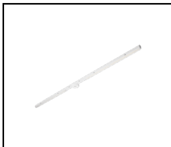
LINEA S LED chain pendant (981425)