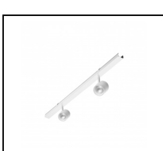
LINEA S LED 588mm AW DOT CSC 2W 1h NM AT (981234)