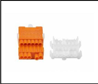
LINEA S LED power set 11P (981388)