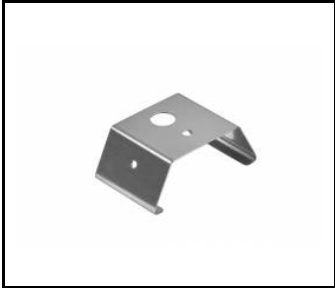
Linea S LED surface mount bracket (980954)