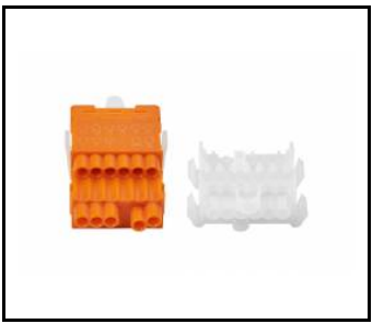
LINEA S LED power set 11P (981388)