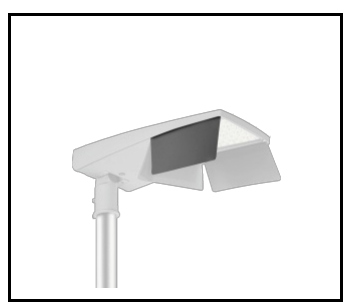
Backshield P (right) Tiara 2 LED M (UL00959)