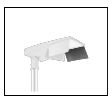
Backshield L (left) Tiara 2 LED M (UL00960)