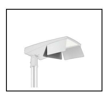
Backshield T (back) Tiara 2 LED M RAL9006 (MOQ 80szt.) (UL00958)