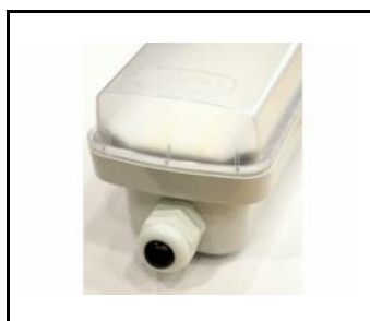
M16 stuffing box plug various PA black M-16 - BPM-21 (60000006)