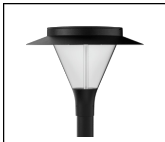
SKVER Hood example 1 RAL9005 (435522)