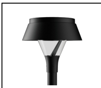
SKVER Hood ULR example 2 RAL9005 (421518)