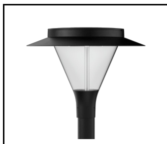
SKVER Hood example 1 RAL9005 (435522)