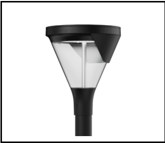
SKVER Backshield RAL9005 (435515)