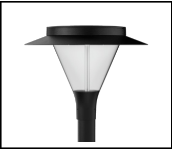
SKVER Hood example 1 RAL9005 (435522)