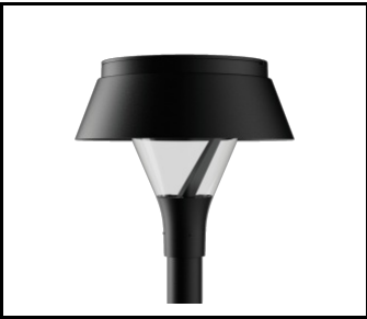
SKVER Hood ULR example 2 RAL9005 (421518)