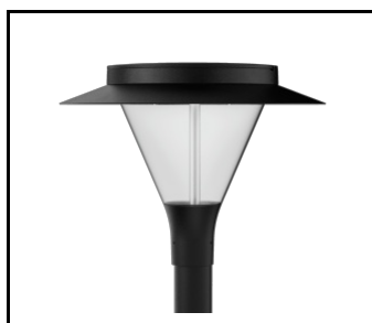
SKVER Hood example 1 RAL9005 (435522)