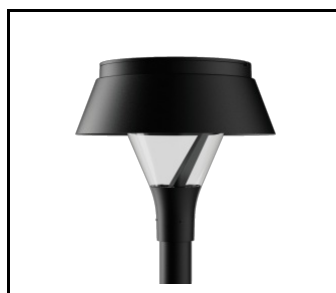
SKVER Hood ULR example 2 RAL9005 (421518)