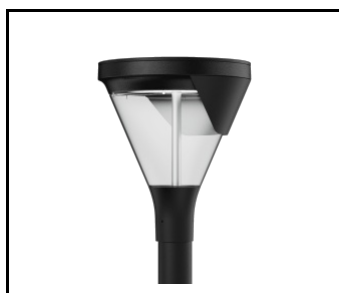
SKVER Backshield RAL9005 (435515)