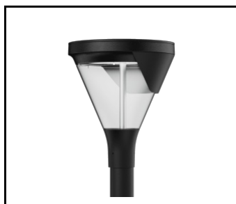
SKVER Backshield RAL9005 (435515)