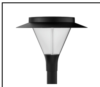
SKVER Hood example 1 RAL9005 (435522)