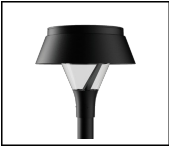
SKVER Hood ULR example 2 RAL9005 (421518)