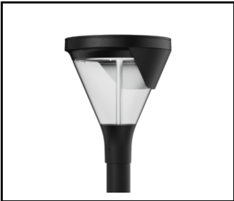
SKVER Backshield RAL9005 (435515)