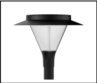
SKVER Hood example 1 RAL9005 (435522)