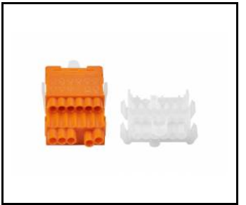
LINEA S LED power set 11P (981388)