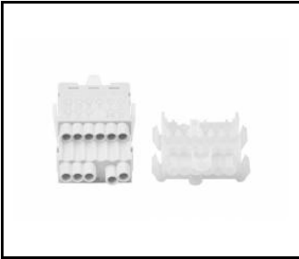
Linea S LED power set 7P (980978)