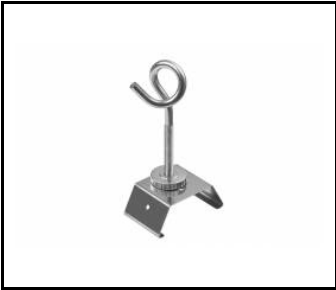
LINEA S LED chain pendant (981425)