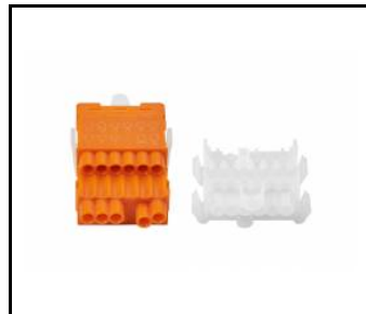
LINEA S LED power set 11P (981388)