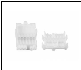
LINEA S LED power set 5P (980084)