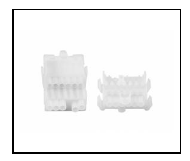
LINEA S LED power set 5P (980084)