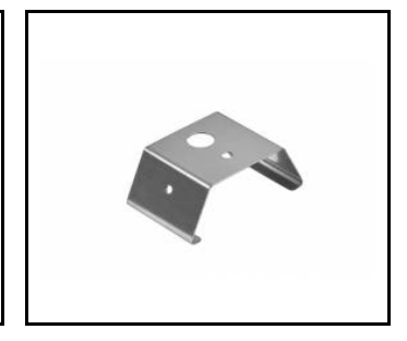
Linea S LED surface mount bracket (980954)