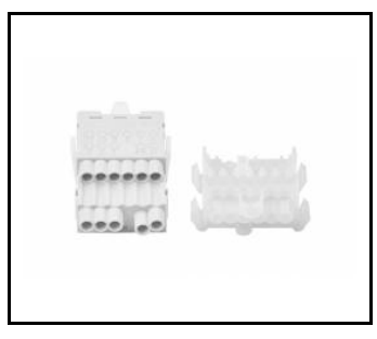
Linea S LED power set 7P (980978)