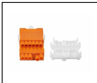
LINEA S LED power set 11P (981388)