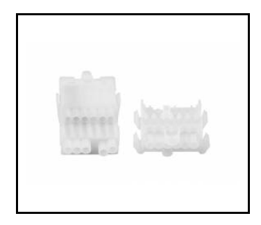
LINEA S LED power set 5P (980084)