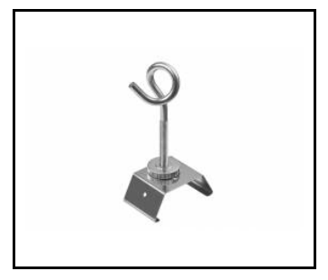
LINEA S LED chain pendant (981425)