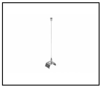
LINEA S LED hang 1.5m (981173)