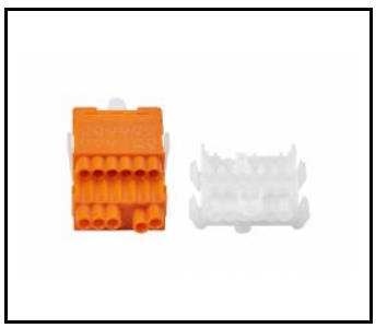
LINEA S LED power set 11P (981388)