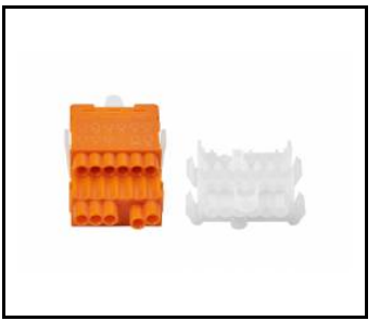
LINEA S LED power set 11P (981388)