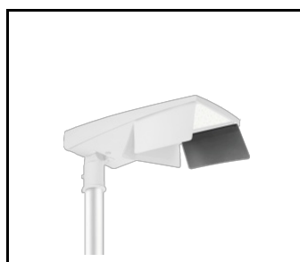
Backshield L (left) Tiara 2 LED M (UL00960)