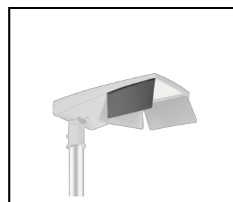
Backshield P (right) Tiara 2 LED M (UL00959)