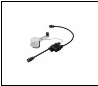
OCULUS LED - RCR motion sensor (964244)