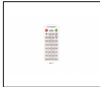
WSEL415 Remote control for - PIR sensor (WSEL415)