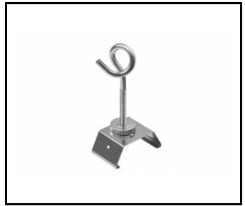
LINEA S LED hang 1.5m (981173)