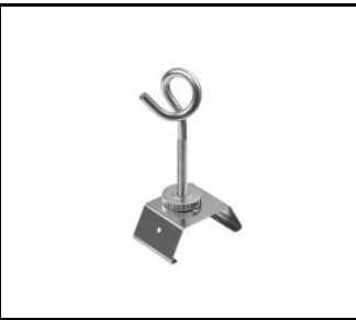
LINEA S LED hang 1.5m (981173)