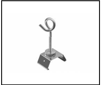
LINEA S LED hang 1.5m (981173)