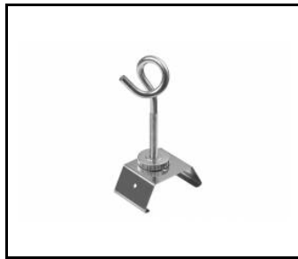
LINEA S LED chain pendant (981425)