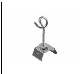
LINEA S LED hang 1.5m (981173)