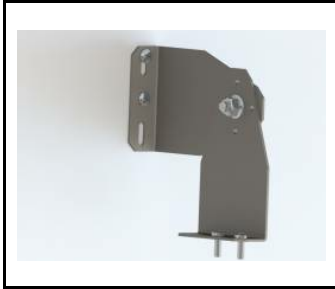
TYTAN LED. ATLAS LED. INDUSTRY LED - adjustable handle (set of 2) (908200)