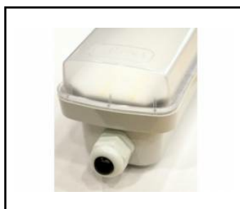
M16 stuffing box plug various PA black M-16 - BPM-21 (60000006)