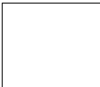
Pole adapter 80/60 ALU (598357)