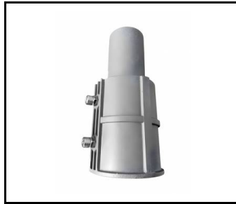
Adjustable bracket Astra LED/Astra LED BASIC aluminium grey RAL 9006 diameter 64 mm Corona 2 LED (UL00214)