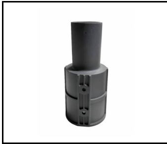
Pole adapter 80/60 ALU (598357)