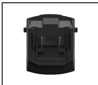
Adapter for Magnum Battery BOSCH / Hikoki 18V (NEW) (608858)