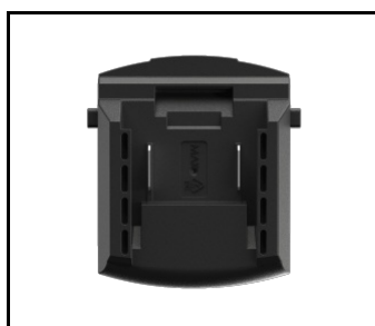
Adapter for Magnum Battery BOSCH / MAKITA (NEW) (608810)