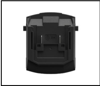
Adapter for Magnum Battery BOSCH / Hikoki 18V (NEW) (608858)