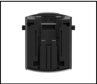
Adapter for Magnum Battery BOSCH / FESTOOL (NEW) (608827)