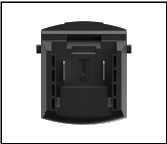
Adapter for Magnum Battery BOSCH / MAKITA (NEW) (608810)