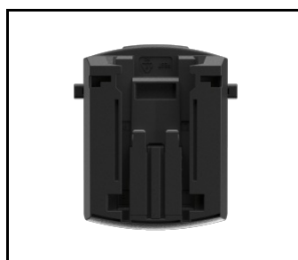
Adapter for Magnum Battery BOSCH / FESTOOL (NEW) (608827)