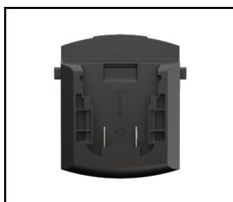
Adapter for Magnum Battery BOSCH / MIL - DEW (NEW) (608803)