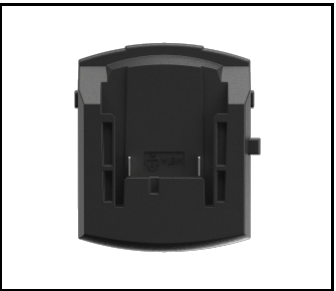
Adapter for Magnum Battery BOSCH / METABO (NEW) (608841)