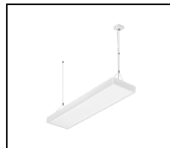
CONTRA LED suspension system 1200x300 (374692)