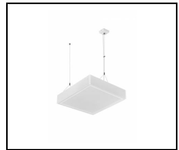
CONTRA LED suspension system 600x600 (374685)